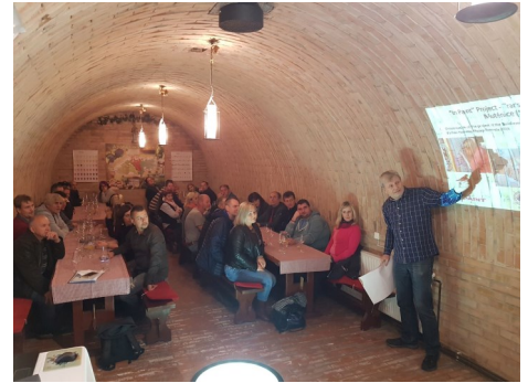
9/11/2018 - Mutenice (CZ)

After a brief presentation of the In Paint project purpose and expected results, small working groups discussed in order to better gather all their perspectives and opinions on the two main project's results: the Open Sources Platform for the Painting/Decorating sector and the WBL Developer profile .