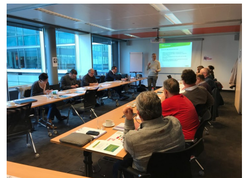
29/01/2019 - Brussels (BE)

The results of these working groups revealed to be very useful, giving similar and inspiring suggestions for improving the final project's outputs. Big interest was expressed for the European dimension of the Platform that should be the starting point to attract more young people to the profession. Some aspects concerning the future Platform were underlined as: