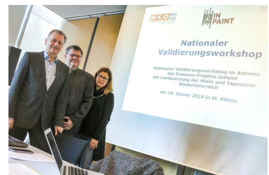
18/01/2019 - St Pölten (AT)