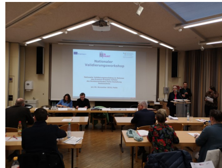
30/11/2018 - Fulda (DE)

Concerning the WBL Developer some competences were pointed up as Leadership qualities, Critical thinking , Analytical skills , Excellent communication skills , Negotiating skills , Teamwork and Adaptation to changing circumstances . It is possible to sum up the importance of the transversal skills .