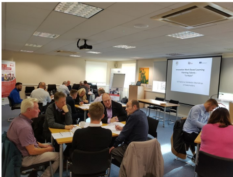
19/11/2018 - Coventry (UK)