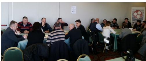
25/01/2019 - Portorož (SI)

Concerning the WBL Developer some competences were pointed up as Leadership qualities, Critical thinking , Analytical skills , Excellent communication skills , Negotiating skills , Teamwork and Adaptation to changing circumstances . It is possible to sum up the importance of the transversal skills .